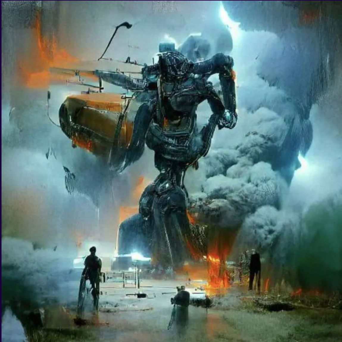
An AI generated image of a robot apocalypse